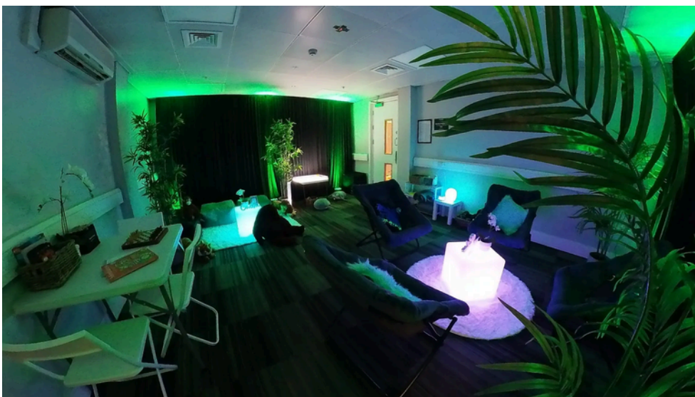
Photo for illustrative purposes only, not final room design