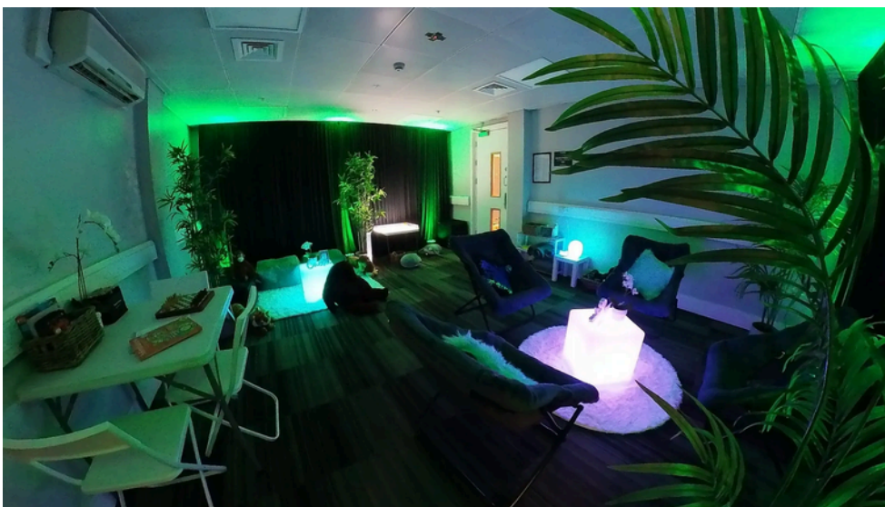
Photo for illustrative purposes only, not final room design